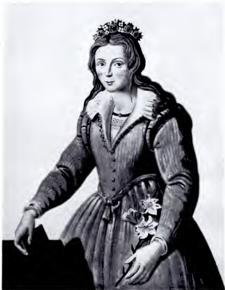
SANTI DI TITO'S PORTRAIT OF ST. MARY MAGDALENE DE' PAZZI After Litta (See page 122)